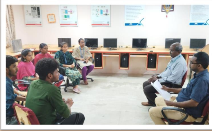
Class Committee Meeting Held for 3rd Year ECE Students

A class committee meeting was organized for the third-year Electronics and Communication Engineering (ECE) students. The meeting focused on discussing academic progress, addressing student concerns, and enhancing the overall learning experience.