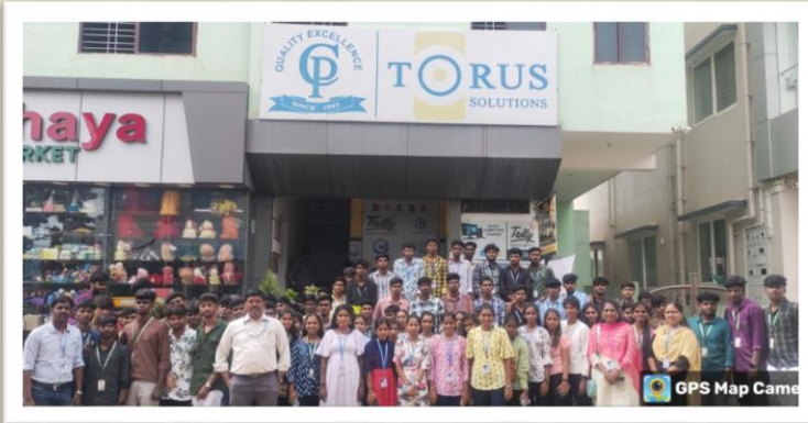
Department of IT Students Visited Torus Solutions, Mysore for Industrial Exposure