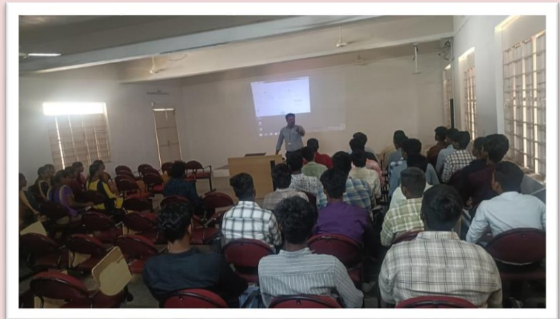
Motivational Session on "Life Skills – Don't Die Before Your Death" for First-Year Students