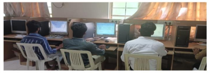
Professional Development Exam for II Year Mechanical Engineering Students