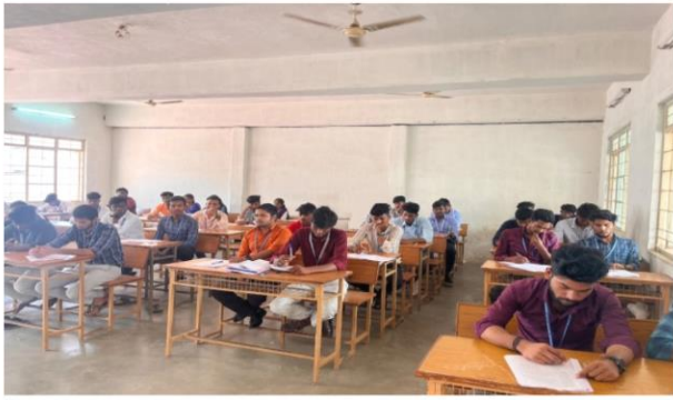
Quantitative Aptitude Learning Exam for III Year Civil, Mechanical, and Robotics & Automation Students