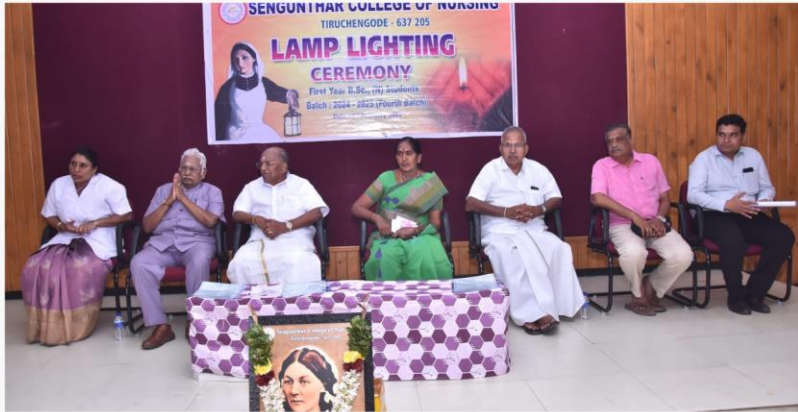
Lamp Lighting Ceremony