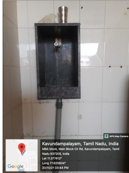
Drinking Water Supply Point (RO water)

taken to restrict wastage of water. RO water is supplied to the college campus and hostel for drinking purposes.