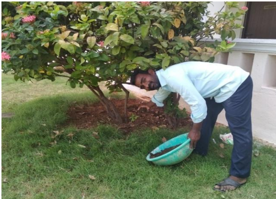
Vermicompost is used in the Garden