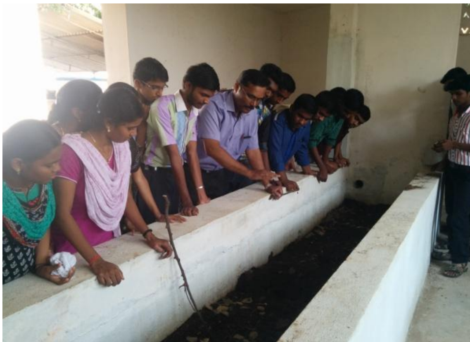
Demonstration of Vermicomposting Plant to the Students