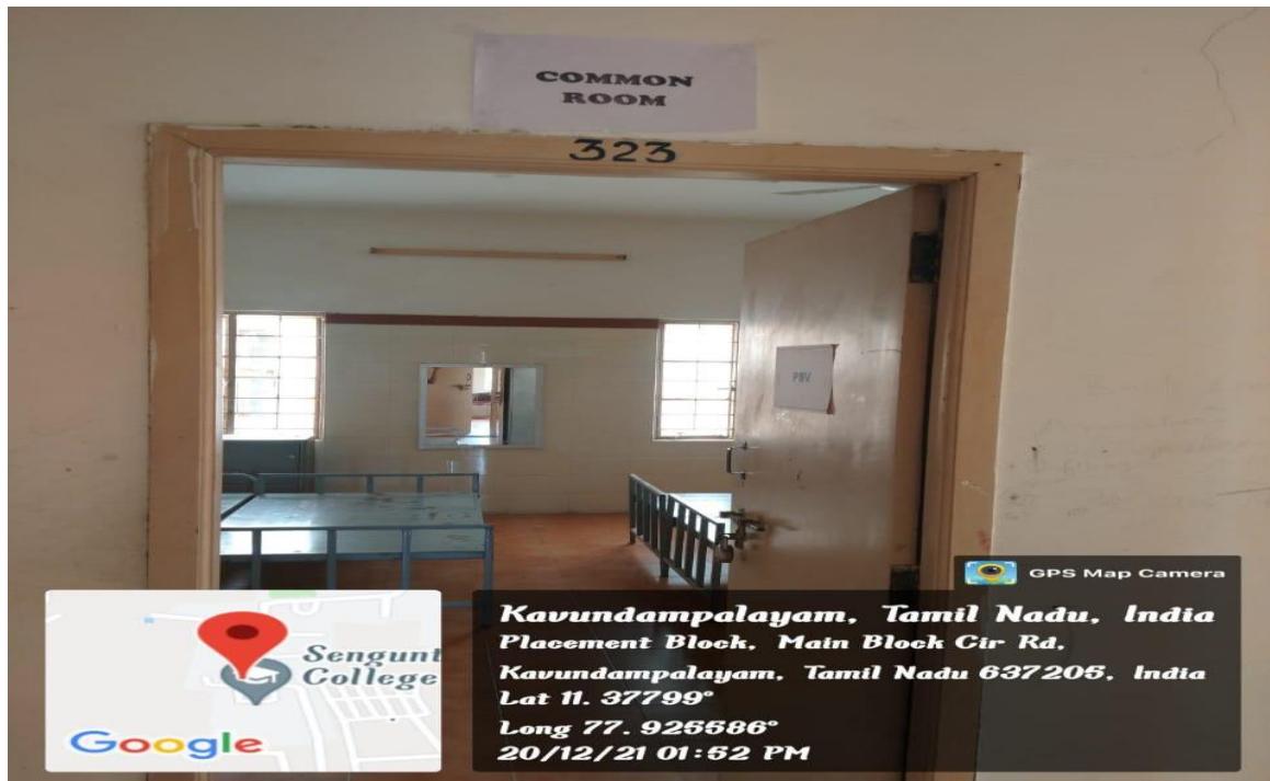
Common Room for Girls