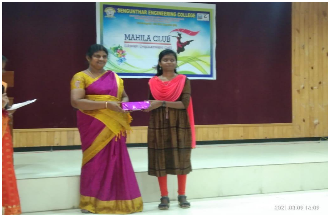
Glimpses of Women's Day Celebration