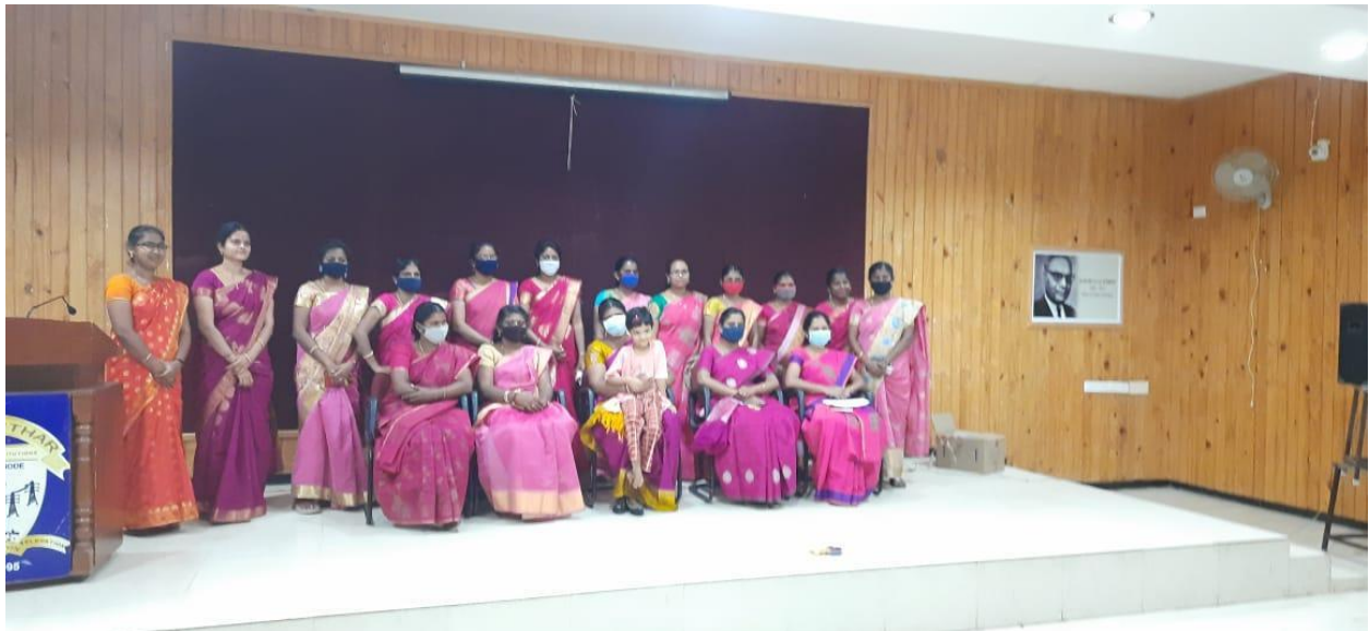
A crew of faculty members in Women's Day Celebration