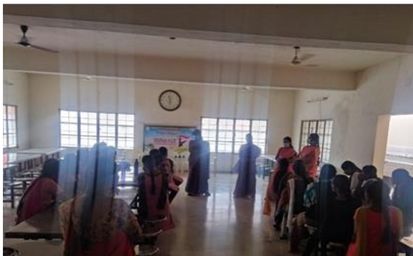
Counseling to the Hostel Students

Counseling and Guidance on Feminine Hygiene and Health to the Girls Students staying in the Hostel is provided by the Team of Female Faculty Members from Mahila Club every month.